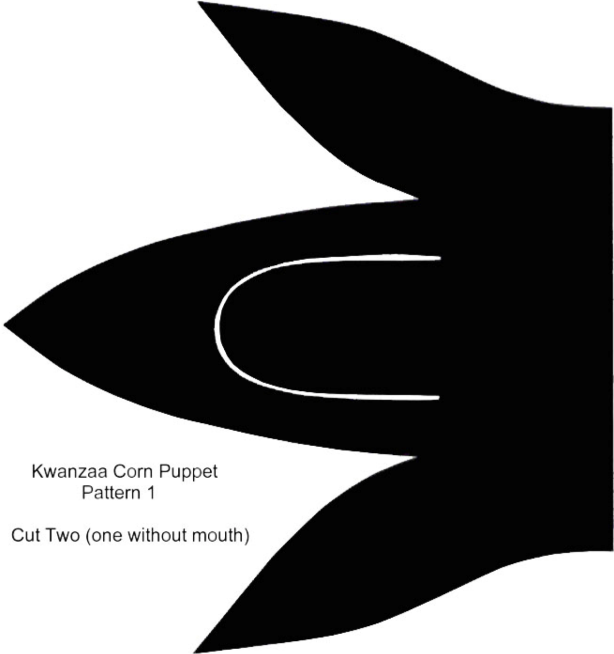
Kwanzaa Corn Puppet Pattern 1